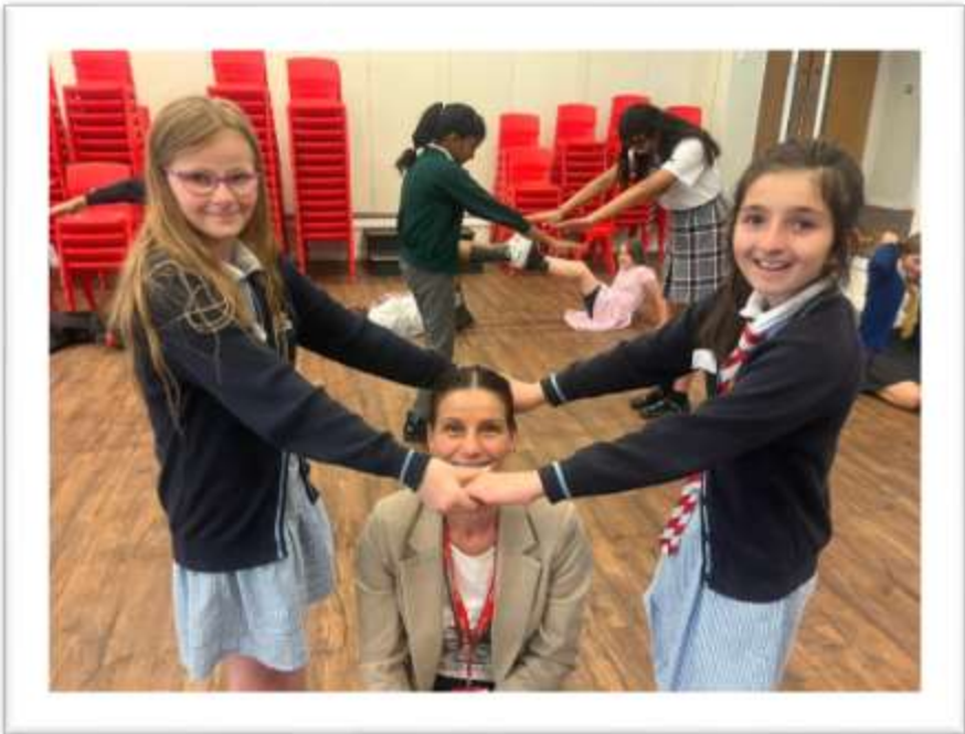
Year 7 Transition Day